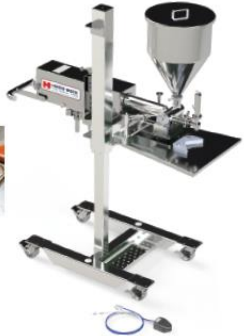
Shown here with optional depositing table and foot pedal.