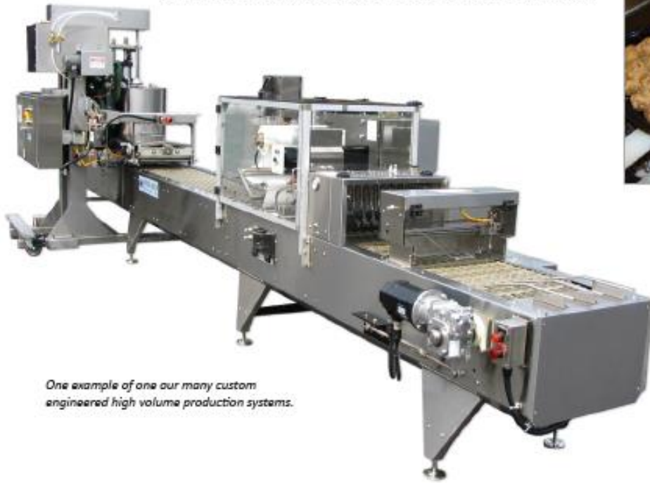
One example of one our many custom engineered high volume production systems.

Whether you're looking to replace an existing system, you've secured new contracts, or the demand for your product is quickly outpacing your capabilities, Hinds-Bock has the right solution for you now...and in the future.