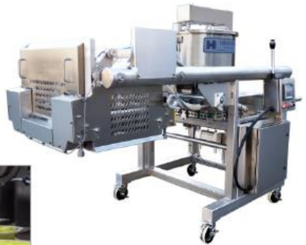
Multi-Piston Filler with Servo Shifting Spout Bridge for high volume production. Partners great with conveyor or horizontal vacuum former.