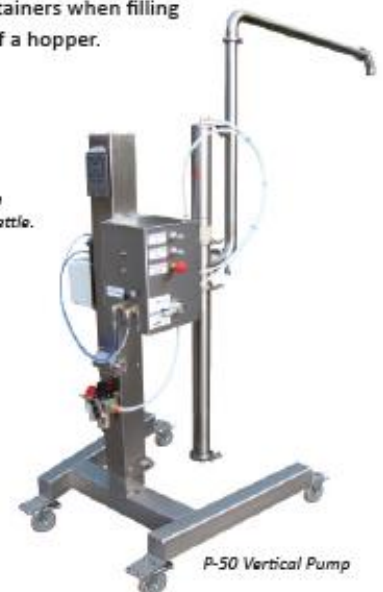
P-50 Vertical Pump