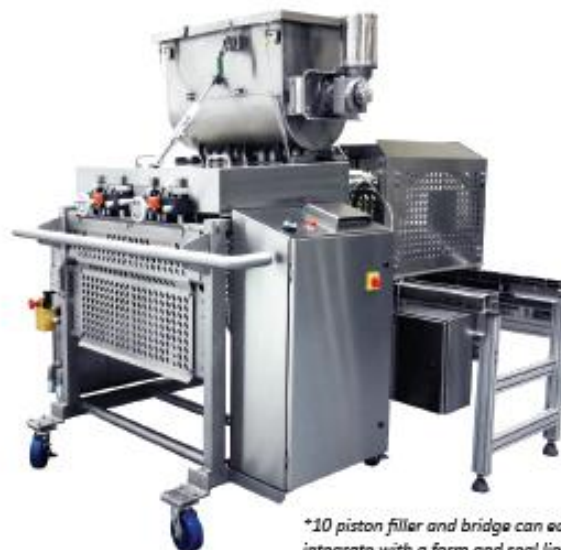
*10 piston filler and bridge can easily integrate with a form and seal line.