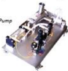
P-128 Transfer Pump

Available in 2 models - P-128 (with 3" suction discharge ports) and P-250 (with 4" suction discharge ports).