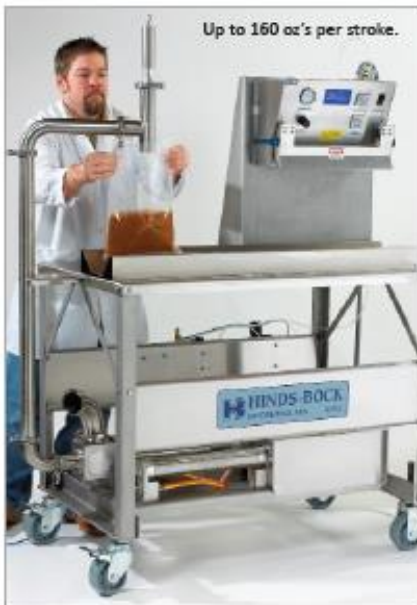
SP-160 Fill Station - Fill and Seal Features large port openings and direct from kettle connection for gentle, accurate portioning of smooth or large chunky products.