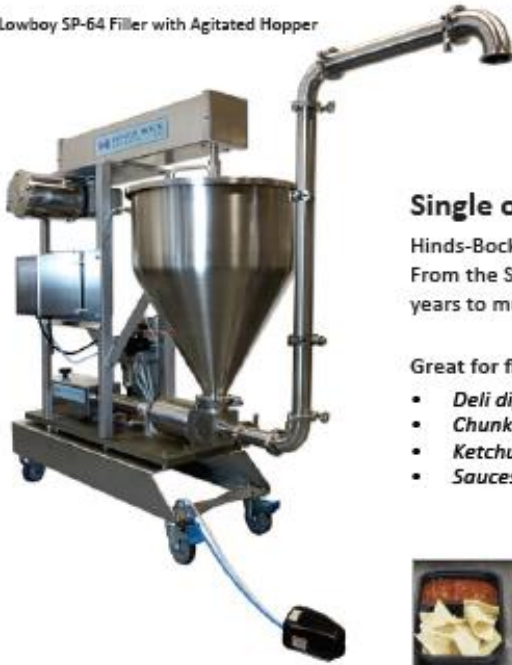
Lowboy SP-64 Filler with Agitated Hopper