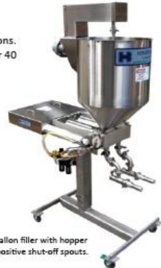
2P-160 twin gallon filler with hopper agitator and positive shut-off spouts.