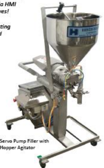
Servo Pump Filler with Hopper Agitator