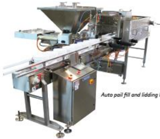
Auto pail fill and lidding line.