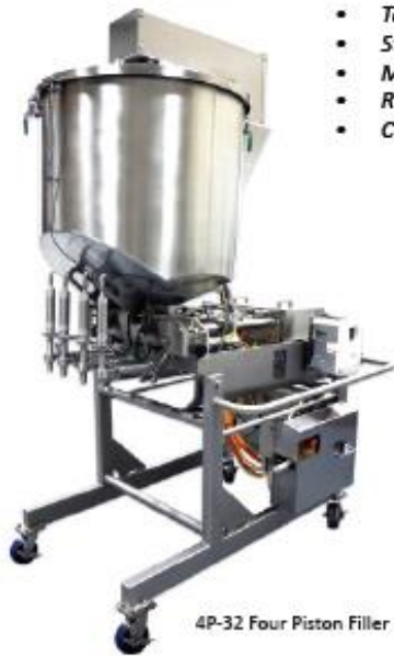
4P-32 Four Piston Filler