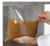
Sealed & ready to go