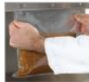
Baked beans in sauce