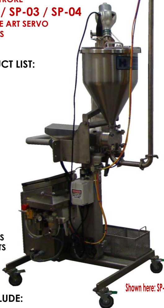
Shown here: SP-01 "ROLL-IN-FRONT" FILLER