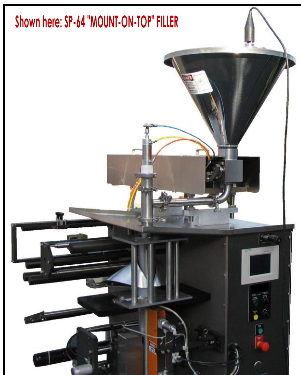
Shown here: SP-64 "MOUNT-ON-TOP" FILLER